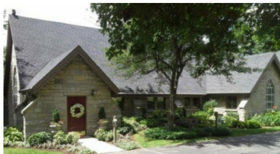
The Herald is a monthly publication of St Raphael the Archangel Episcopal Church.