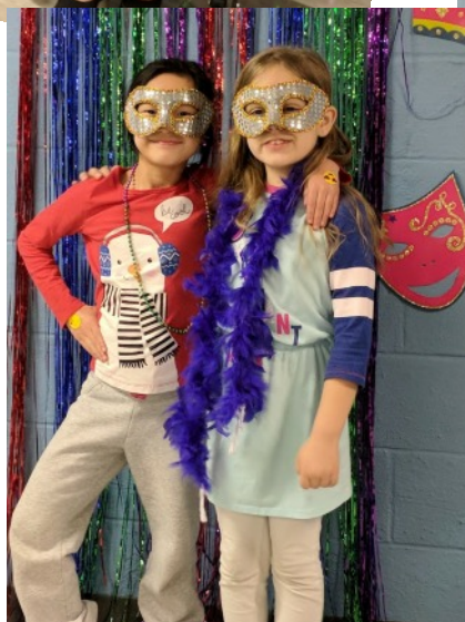
Shrove Tuesday Fun!