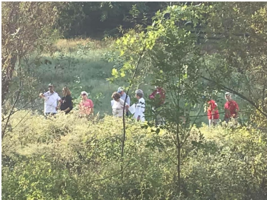
St. Michael's and St. Raphael members exploring Tobit's Trace before our celebration of Angels Service.