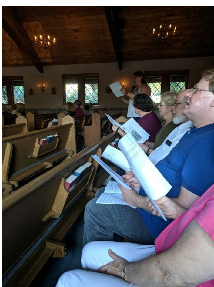
Choir members from both St. Michael's and St. Raphaels joined together in worship during Compline for our celebration of Angels.